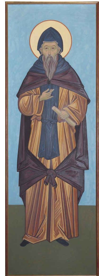
St Cyril with a Slavonic script scroll of the Gospel