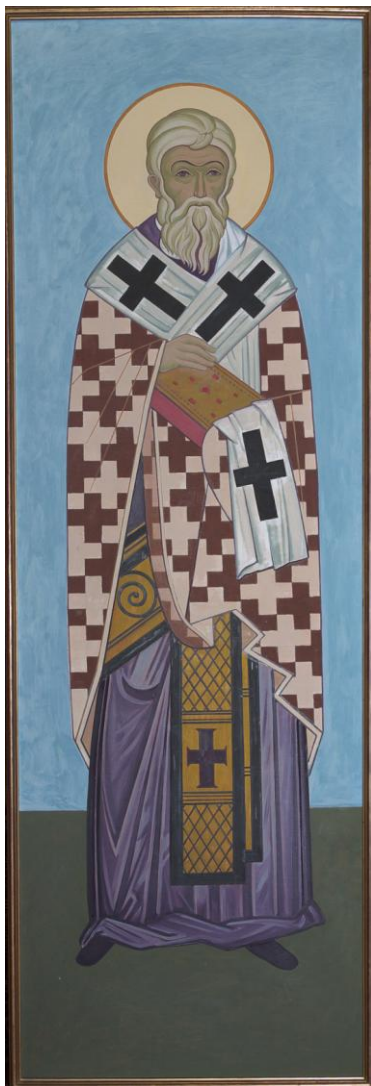
St Methodius in Bishop's Apparel holding the Gospels